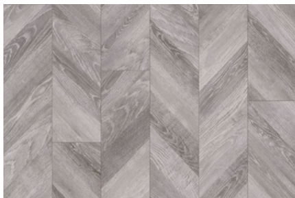
Plank (1): 725-1622-1 (22 mil) Plank (2): 725-1622-2 (22 mil)