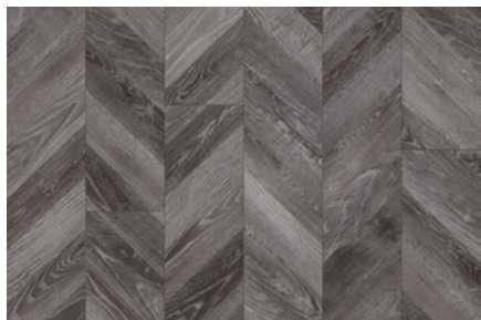
Plank (1): 725-1621-1 (22 mil) Plank (2): 725-1621-2 (22 mil)