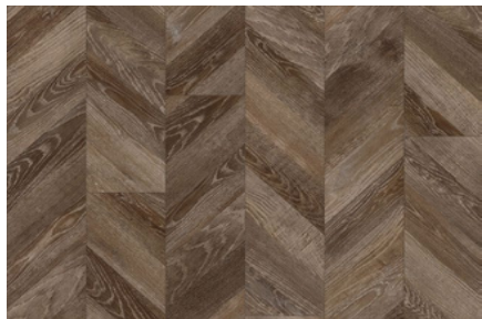
Plank (1): 725-1627-1 (22 mil) Plank (2): 725-1627-2 (22 mil)