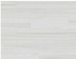
648-711-B (8 mil) 648-711-A (12 mil)