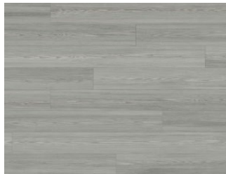
648-710-B (8 mil) 648-710-A (12 mil)