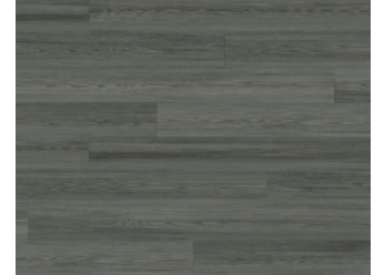
648-708-B (8 mil) 648-708-A (12 mil)