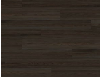
648-706-B (8 mil) 648-706-A (12 mil)