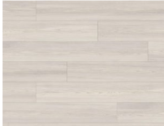
648-701-B (8 mil) 648-701-A (12 mil)