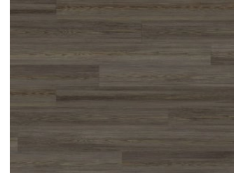
648-704-B (8 mil) 648-704-A (12 mil)