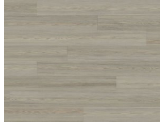
648-703-B (8 mil) 648-703-A (12 mil)