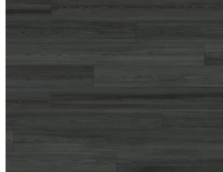
648-707-B (8 mil) 648-707-A (12 mil)