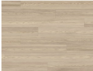
648-702-B (8 mil) 648-702-A (12 mil)